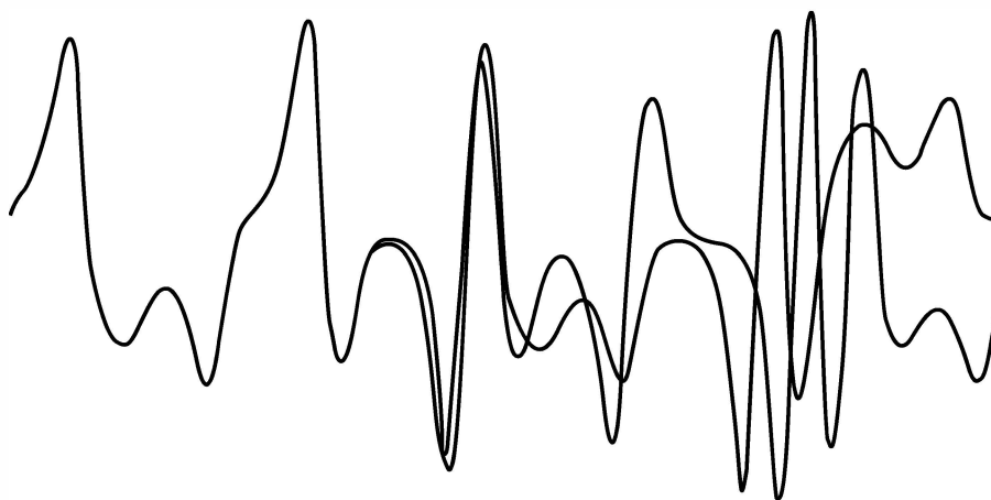
FIGURE 17.2 Plots of the data from two simulations of weather response over time. SOURCE: BRADLEY (2010)